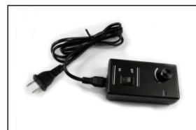
One-way Illumination Controller PMS-ICT