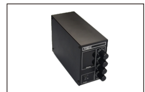
Multi-way Illumination Controller PMS-LP12V1AX2