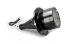
250Telecentric Illumination PMS-LTD250