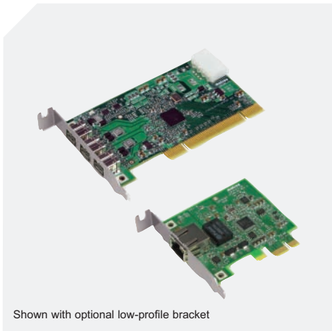
Shown with optional low-profile bracket

Family of Gigabit Ethernet NICs and IEEE 1394b adaptors.